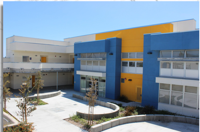
Knox Middle School: Before, During, After