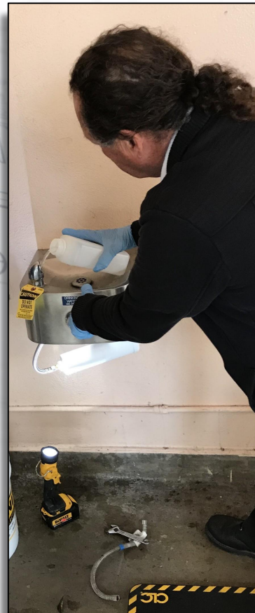
Lead Solder Removal