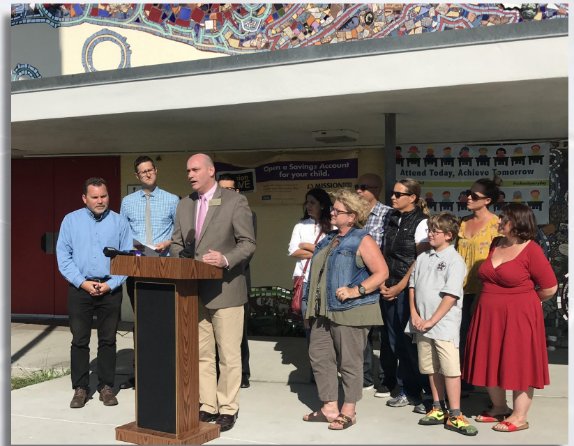
New water standards press conference