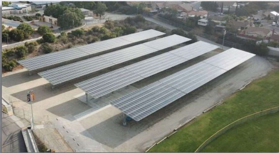
Solar photovoltaic system, Morse High School