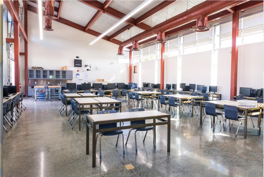
Kearny High School Design and Construction Lab